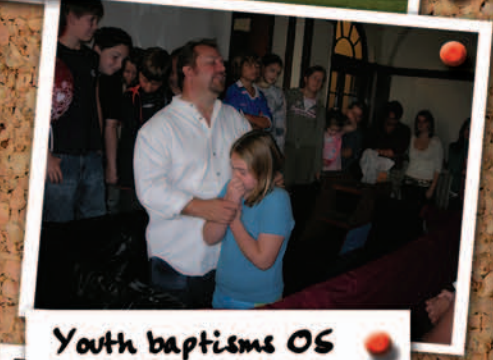
Youth baptisms 05