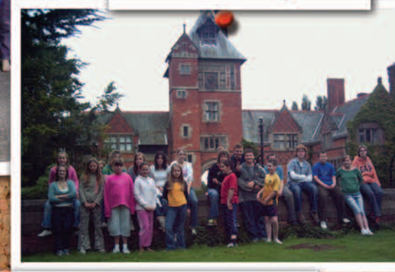
Kids at Cloverley Sept 05