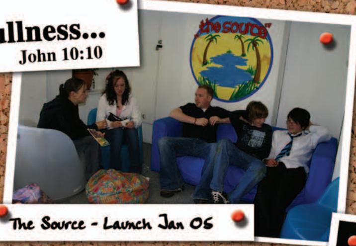
The Source - Launch Jan 05