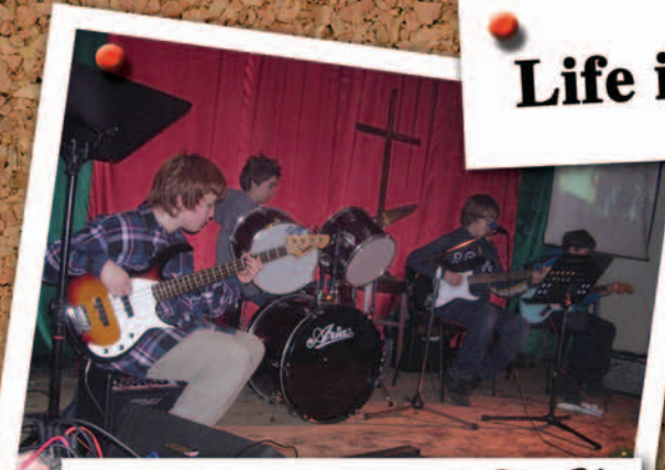
Band - Community Carols Dec 04