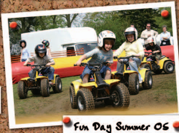
Fun Day Summer 05