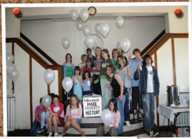
Make poverty history Jul 05