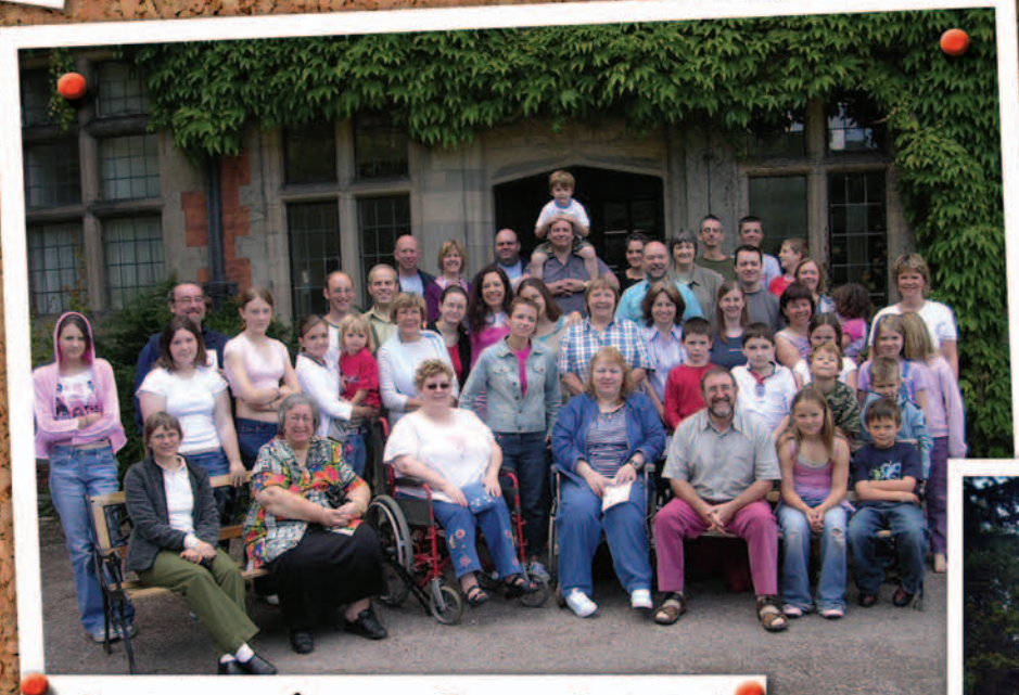
Weekend Away Sept 2005