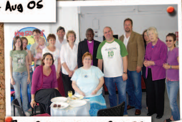
John Sentamu at lunch Sept 05