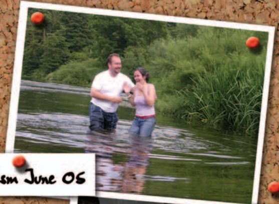
Baptism June 05