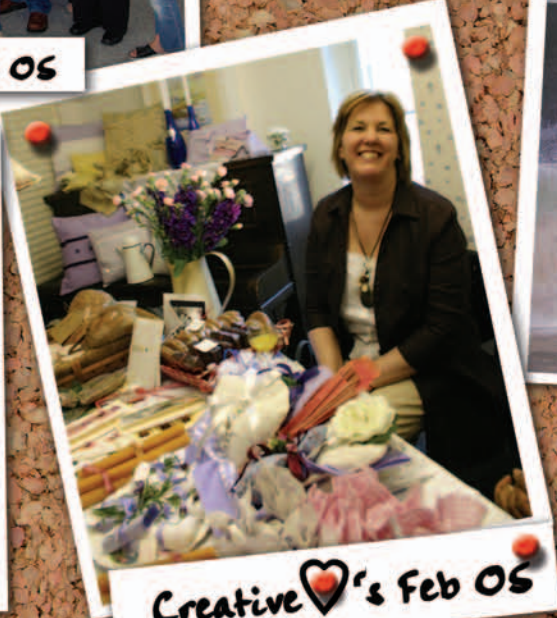
Creative♥'s Feb 05