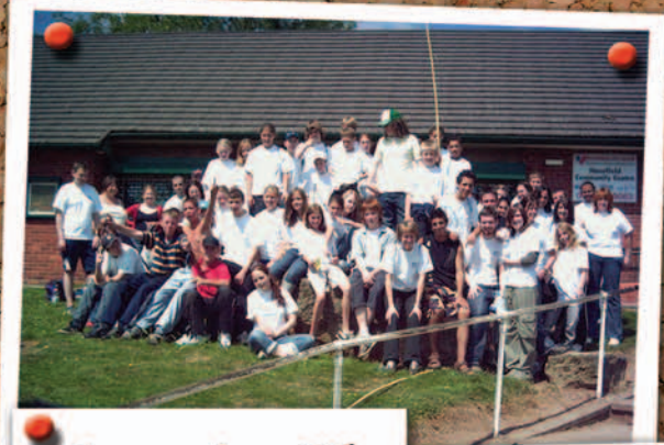
B-Sent Aug 05