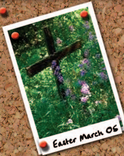
Easter March 05