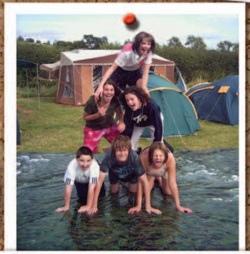
Youth Camp June 05